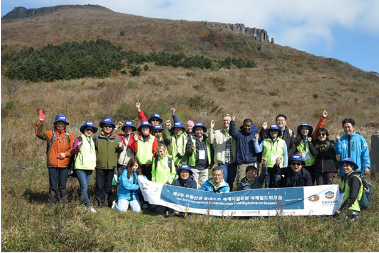
Participants of the workshop during field trip