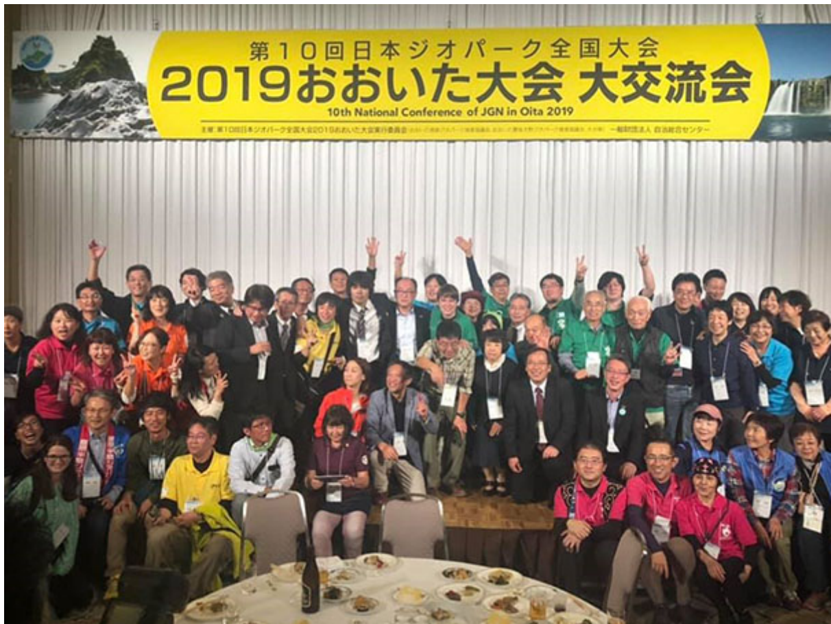
Group photo of the conference participants