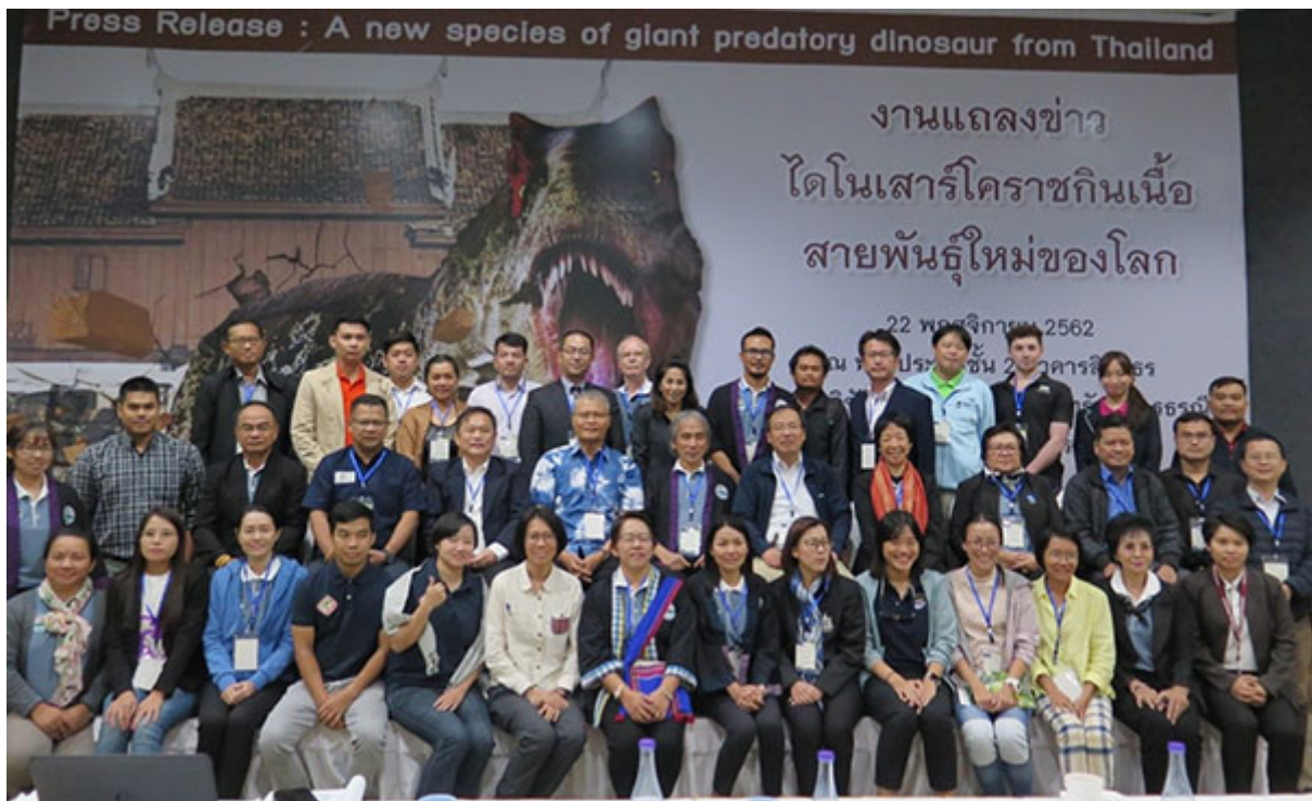
Group photo of the conference participants

Since 2016, the JGN has been engaging in the project of capacity development for countries with no Geoparks, or only a limited number of Geoparks, in the Asia-Pacific region. At the beginning of this project, the JGN invited participants from several countries in Asia-Pacific to observe the activities of geoparks in Japan and also provided opportunities for participants to communicate with people involved in geoparks.