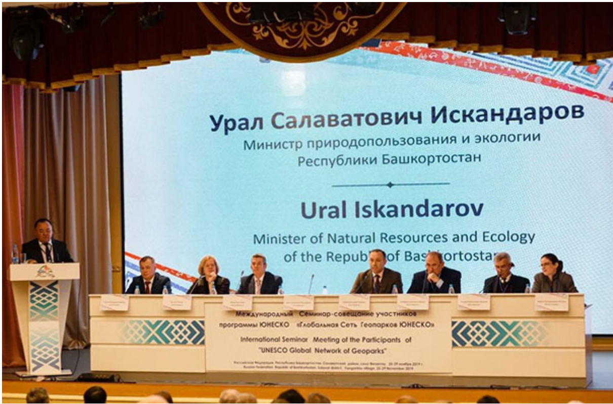
The panel of the International Seminar