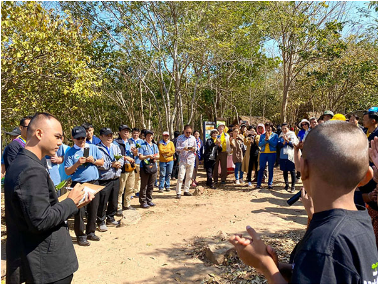
The participants during the field trip